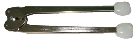
PVC PACKING MACHINE